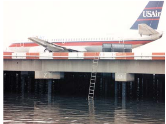
LaGuardia Airport used the SeaShield Series 100 System to provide corrosion protection for over 2,000 steel piles.