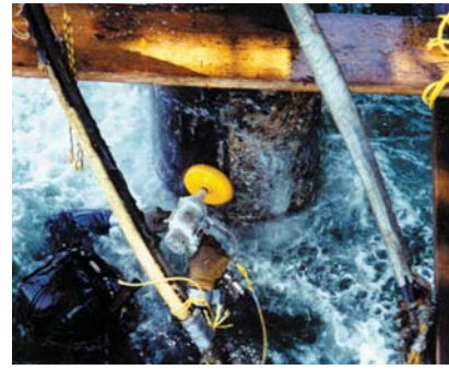
▲ The components of the Series 100 System can be applied under water with minimal surface preparation. ▼