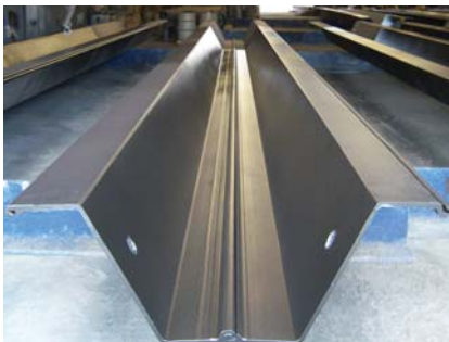
New sheet pile just after Denso Rigspray was applied (55" wide x 45' long weighing over 6,000 lbs).