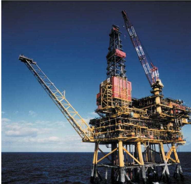
Denso Rigspray can be used on offshore rigs and structures to protect areas subjected to high corrosion.