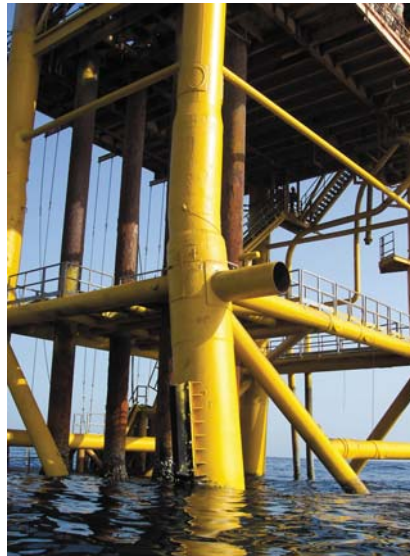
One-coat protection for steelwork in marine environments.