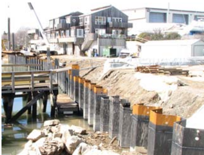
Side view showing initial phase of the Boston Marina using Denso Rigspray steel sheet piles.