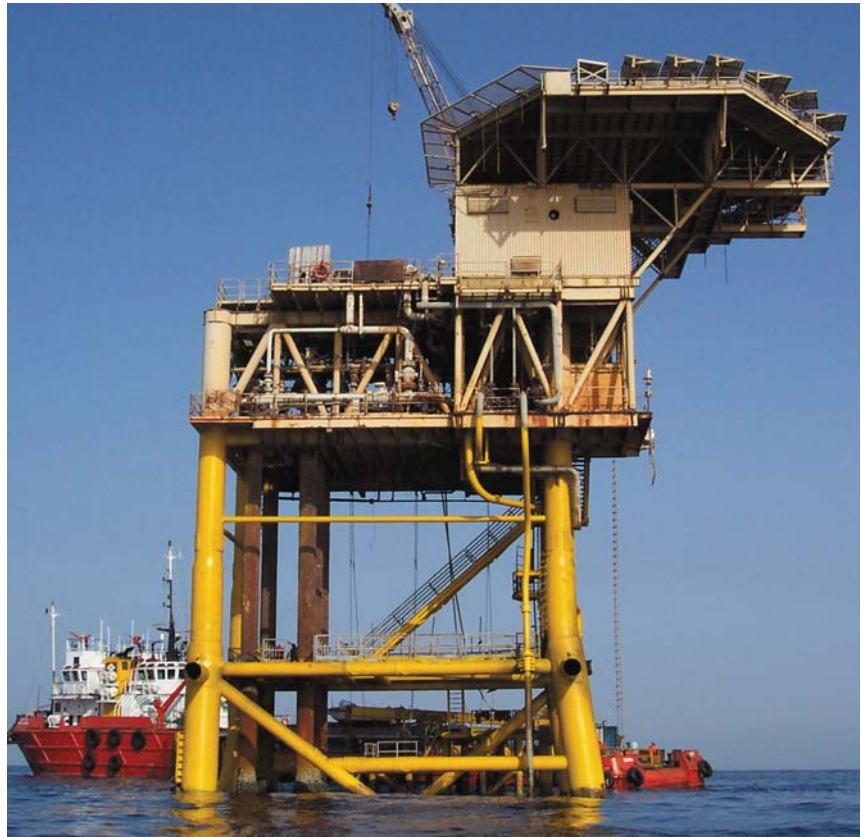
The one-coat glass flake reinforced polyester coating which can be applied by airless spray to achieve a dry film thickness of 30 - 40 mils in a single coat.