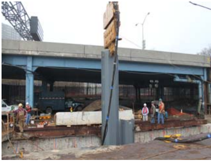
Rigspray coated steel sheet piles being driven into the mudline for a transportation project in Manhattan, NY.