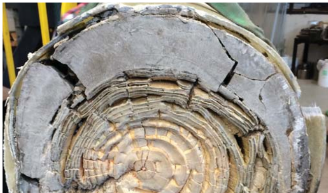
All specimens withstood 3 to 4 times the failure load of the baseline control specimen.