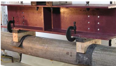
Bending test setup & actuator for the SeaShield Series 400.