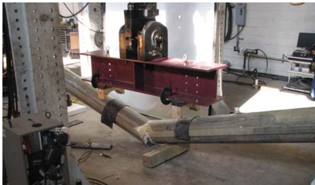
SeaShield Series 400 System at least doubles the maximum load than an undamaged, unprotected timber pile.