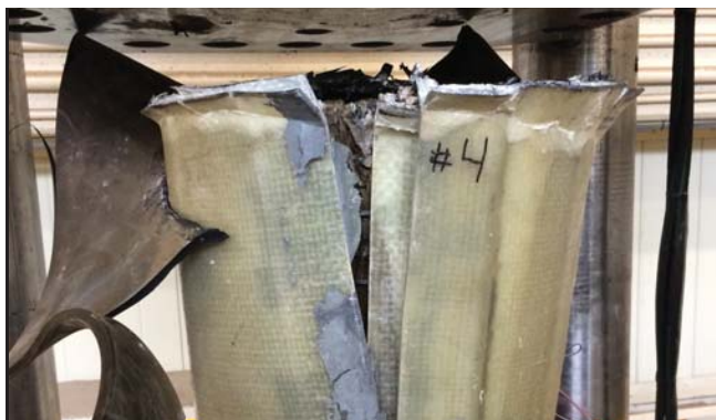
Timber piles installed with the SeaShield Series 400 System were able to withstand a maximum compressive pressure up to 466.6 kips.