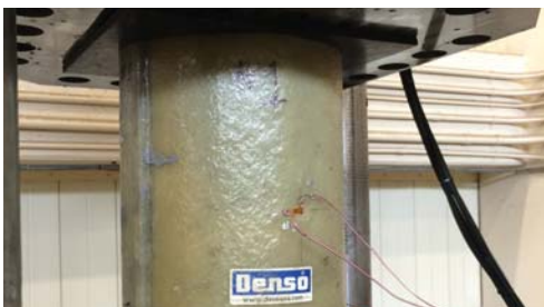
Compressive test setup.