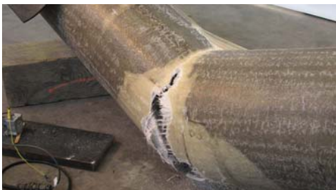
Completed bending test – all piles doubled in strength compared to the original unprotected piles.